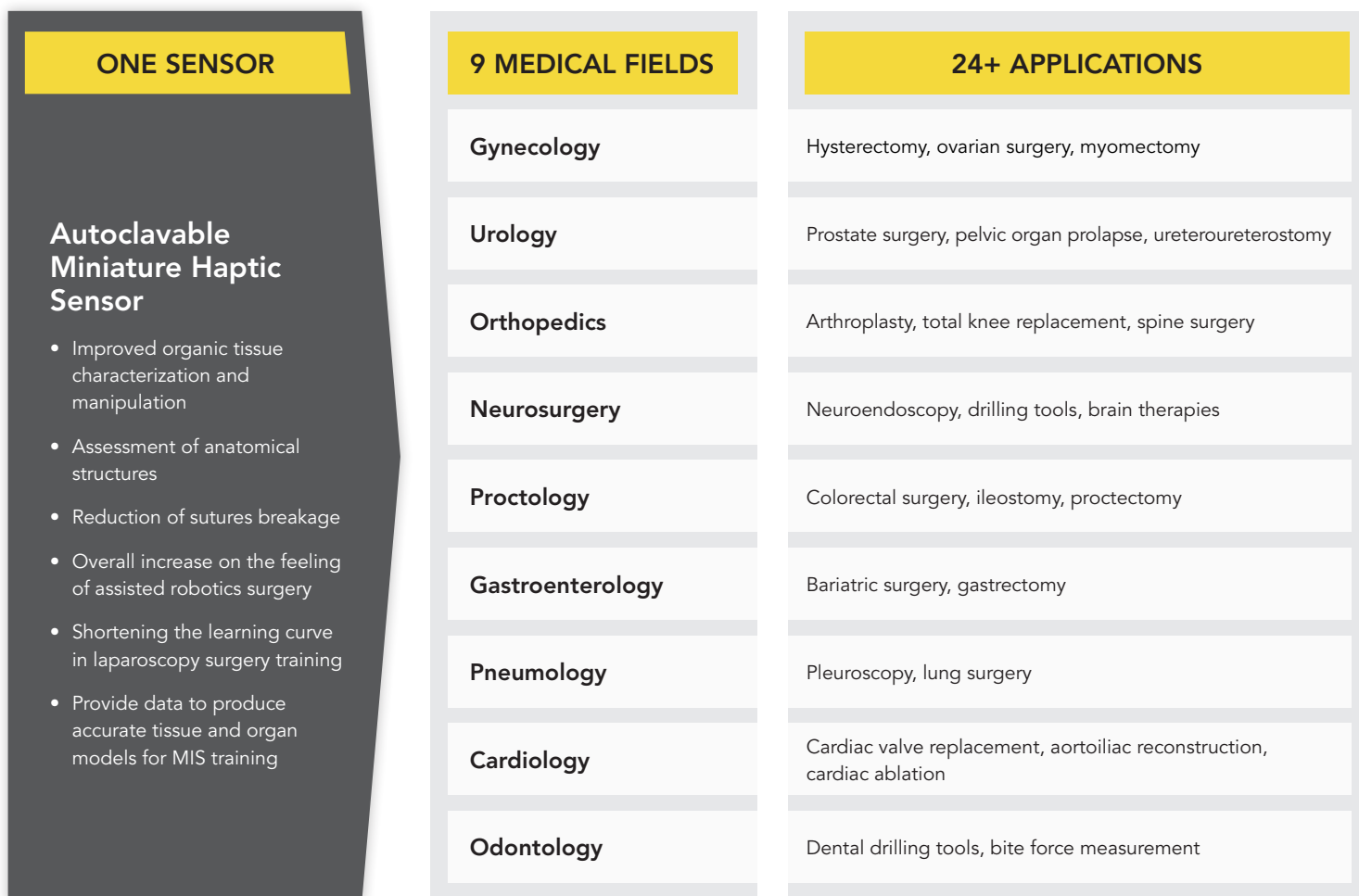
Figure 1. With a force, torque and pressure sensor enabling haptic feedback to the hands of the surgeon, robotics minimally invasive surgery can be performed with higher accuracy and dexterity while minimizing trauma to the patient.

The design and manufacture of a haptic feedback sensor for a robotic surgery platform entails two distinct but complementary aspects: overcoming technical obstacles of designing a sensor for intra- abdominal force measurement (miniaturization, biocompatibility, autoclavability and high reusability), while maintaining the minimally required specification of a high-grade force measurement solution (nonlinearity, hysteresis, repeatability, cross-talk, bandwidth and noise-free resolution). Furthermore, the sensor solution provider must have a talented and multidisciplinary engineering team, in-house manufacturing capabilities supported by fully developed quality processes and product/project management proficiency to handle the complex, resource-limited and multi-stakeholder new product development environment.